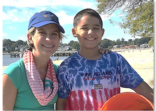
Community service cleanup project at Cummings Park