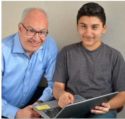
Receiving a new laptop for high school

discuss issues they may be facing. Discussion topics include coping skills, developing a framework of values, self-advocacy, peer pressure, resilience, and GRIT. As a special field trip this year, the students visited the Pray Achievement Center in Greenwich.