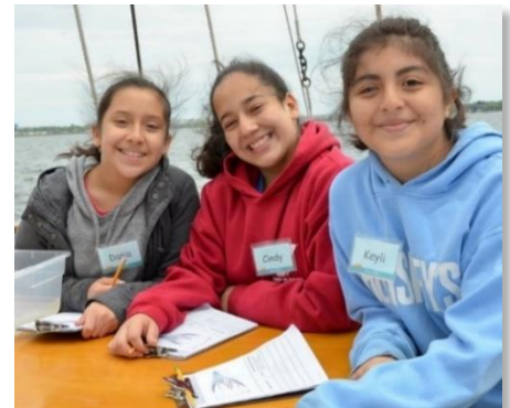
Aboard the SoundWaters Schooner

In addition, Stamford students in grades 5, 8, and 10 are required to participate in the state assessment in science. In spring 2017, Starfish students outperformed SPS students in grade 5 (100% at goal in comparison to 50% districtwide), grade 8 (60% at goal in comparison to 55% districtwide), and grade 10 (60% in comparison to 25% districtwide).