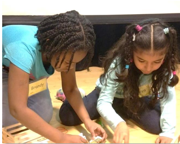
Kinetic Contraptions Workshop, Stepping Stones Museum for Children

Over the winter break, the students visited Stepping Stones Museum for Children to learn about energy. Rounding out the year, our youngest Starfish cruised on the SoundWaters Schooner and spent time on the popular and challenging ropes course at Scalzi Park.