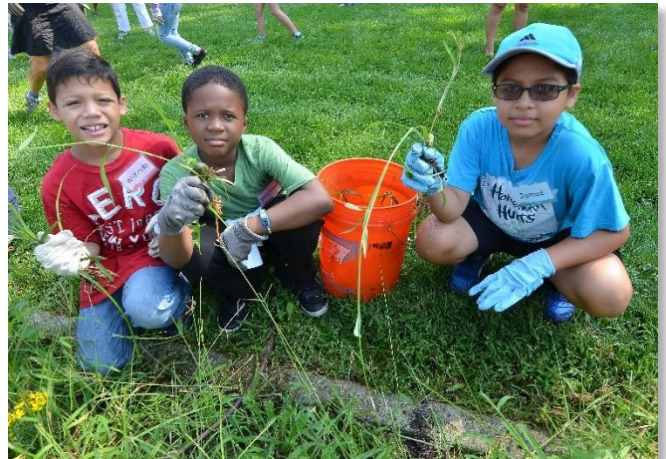
Community service project pulling weeds at Mill River Park

Starfish Connection is an all-volunteer organization. We do not incur any staffing or building costs. Business expenses are paid in full by the founders, and all donations and grants go directly to programming for Starfish students.