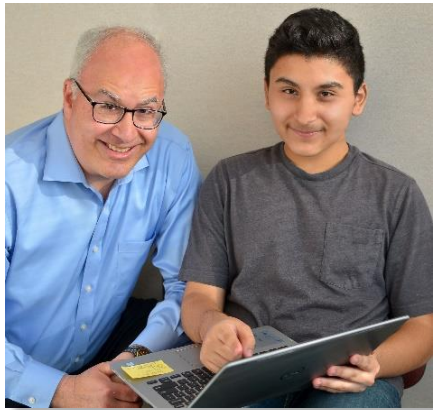
Receiving a new laptop for high school

discuss issues they may be facing. Discussion topics include coping skills, developing a framework of values, self-advocacy, peer pressure, resilience, and GRIT. As a special field trip this year, the students visited the Pray Achievement Center in Greenwich.