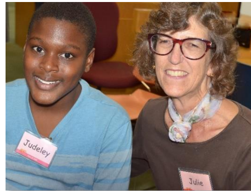
Preparing for college admission