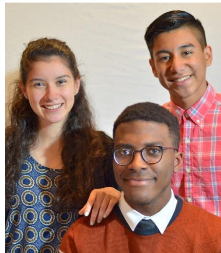
2017 Starfish high school graduates

What is unique about Starfish Connection? We select five or more promising 3 rd -grade students each year from the Stamford Public Schools. Each of our students is matched with an individual mentor who is committed to guiding that student from 3 rd grade through 12 th grade and beyond. Most mentoring programs are short-term interventions. Our program is longitudinal, comprehensive, and individual – it’s about transforming lives one at a time.